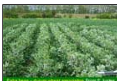
Faba bean-durum wheat association