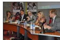
From L to R: Representatives from the Bill & Melinda Gates Foundation, CGIAR Consortium, Agropolis Fondation (President and its Director) and USAID during the Francophone AWARD Seminar held in June 2011 in Montpellier

"I am very pleased to see that the initial discussion we started last year on how we, Agropolis Fondation and the AWARD Programme, can work together in supporting scientific capacity building of African women, is coming into fruition. We are cognizant of the initial efforts and early success of the AWARD