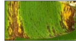
Mycosphaerella fijiensis fungi in banana leaves

Attended by researchers and engineers involved in the BIOFIS project and representatives of government agencies, e.g., Ministry of Ecology and of Agriculture, the meeting aimed at motivating the involvement in the project of representatives of public bodies dealing with the formulation and implementation of norms and regulations. It was also organized to strengthen linkages between applied and academic sciences.