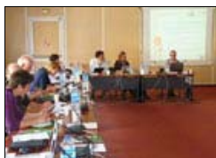
The experts dialogue gathered together around 30 experts from various sectors who are users of genetic resources in agriculture sector (plants, farm animals, aquaculture, forest, microbes, invertebrates).