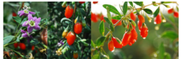
Lycium barbarum flowers and fruits. Amagase and Farnsworth, 2011.

The overall objective of GOJINOV is to characterize the physiology of goji plants subjected to contrasting watering regimes and pruning practices. The experiments will be performed on novel goji varieties and goji x tomato hybrids. We aim at gaining basic knowledge on this innovative genetic material to support the development and strengthening of a production sector for goji in Mediterranean regions where climate seems to be appropriate for Lycium cultivation. We also aim at providing comparative insight for increasing fruit quality and adaptation to drought of tomato species.